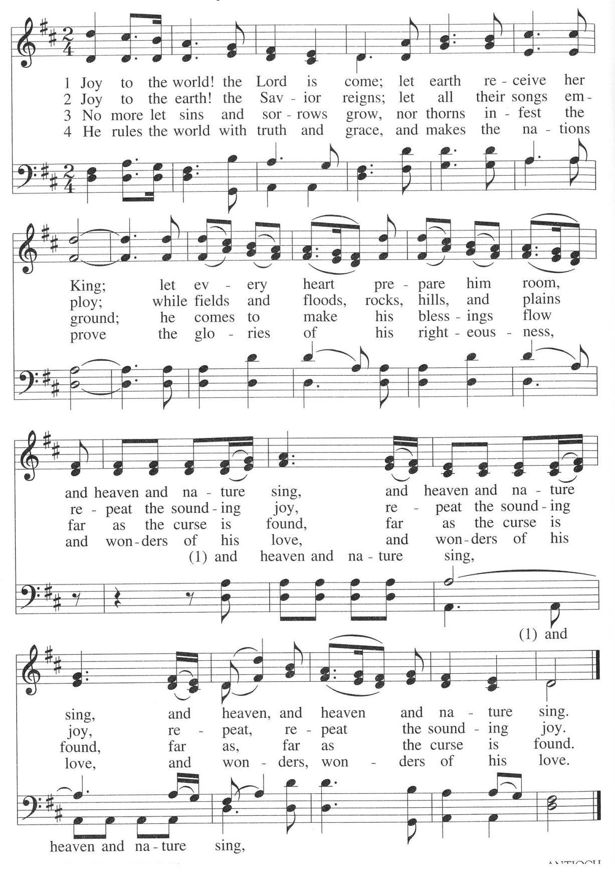
*CLOSING HYMN - "Joy To the World"